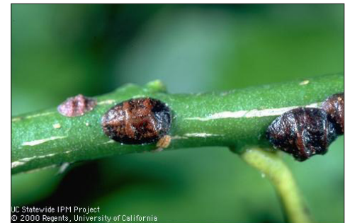
UC Statewide IPM Project © 2000 Regents, University of California

You may have noticed a black deposit on your olive trees recently that looks just like its namesake: soot. It is sooty mold, a fungus that grows on the honeydew produced by certain sucking insects. In the case of olives, the suspect insect is most likely to be black scale.