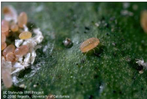
UC Statewide IPM Project © 2000 Regents, University of California

brown to black. They are slightly oblong, and domed, with a very distinctive H-shaped ridge on the back. The first stage juveniles (called crawlers) are orange to yellow, and it is only during this stage of their lives that the scale can be observed moving around. The crawlers are very small and it usually requires a hand lens to see them.